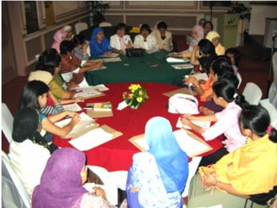
Poverty reduction workshop