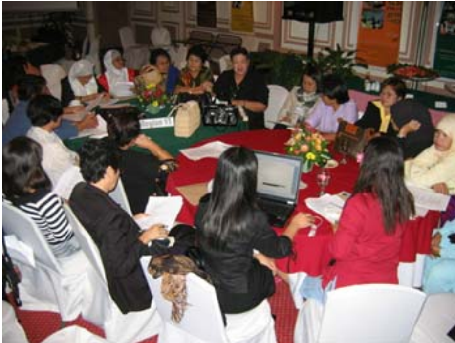
Politics and governance workshop