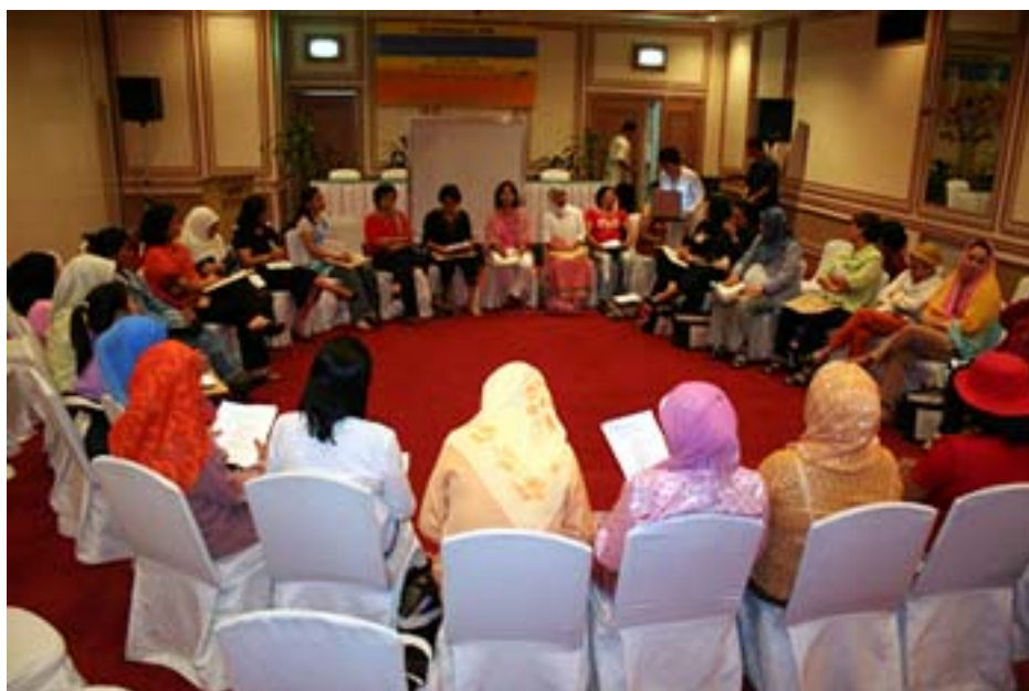
Peace and multiculturalism workshop